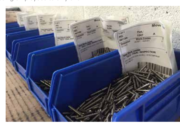
Move tickets identify where the parts have come from and where they are going for the next operation.

"The best part is having complete visibility of what's happening on the shop floor in real time," she adds. "We can see firsthand who is doing what and delegate responsibilities faster. This allows us to move people into production quicker, making us more efficient while helping improve on-time deliveries."