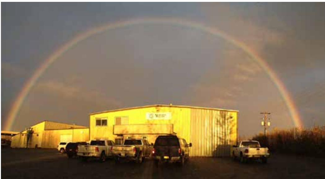
Alaska Roteq’s Wasilla, Alaska facility

“Global Shop Solutions ERP software is like one-stop shopping for all your business management needs,” he concludes. “With one system you can take care of all your purchasing, scheduling, work orders, shop floor controls, new order entry, accounts payable and receivables. You name it and the software can do it – all in one place.”