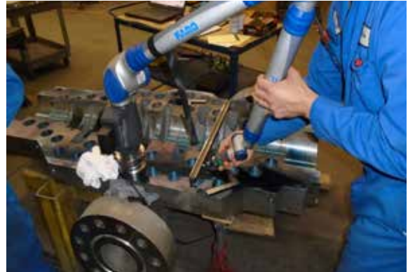
Faro Arm inspection of pump case

Headquartered in Wasilla, Alaska, just north of Anchorage, Alaska Roteq focuses primarily on the servicing and repair of rotating equipment, including large pump repair for companies operating on Alaska's resource-rich North Slope. An authorized repair facility for Flowserve Corp., one of largest pump manufacturers in the world, Alaska Roteq also provides in-house machining services, thermal spray coating, welding, and balancing, as well as field machining, field mechanics and engineering services.