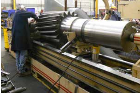
Machine repair of Pinion Gear shaft

Founded in 1993, Alaska Roteq Corporation started out as a small OEM repair facility and has since grown into one of the largest machine repair shops in the state of Alaska, providing industrial distribution and repair services to companies in the oil and gas, power generation, water and waste water, mining, construction and other industries.